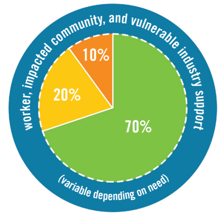
Revenue Allocation & Investment

In making investments, we believe that jobs created through this policy should be high quality, family- and community-sustaining jobs. To achieve this, our investment decisions will be based on labor standards criteria that provide prevailing wage rates, apprenticeship and pre-apprenticeship utilization standards, use of domestic content whenever practicable, and use of community workforce agreements to prioritize local hire.